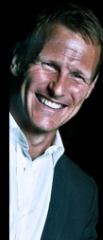
TEDDY SHERINGHAM 2013 AMBASSADOR