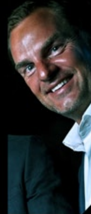
RONALD DE BOER 2013 AMBASSADOR