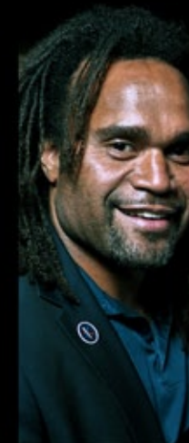
CHRISTIAN KAREMBEU DAY OF LEGENDS AMBASSADOR