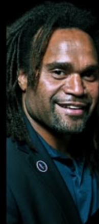
CHRISTIAN KAREMBEU DAY OF LEGENDS AMBASSADOR