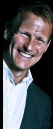
TEDDY SHERINGHAM 2013 AMBASSADOR

MONTE-CARLO GOLF CLUB CHAMPIONS ON APPROACH