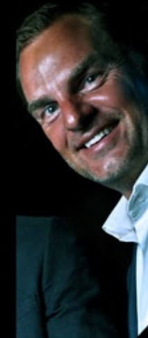
RONALD DE BOER 2013 AMBASSADOR